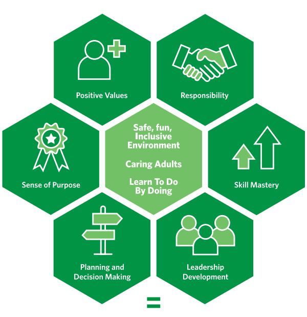
Responsible, Caring, Contributing Leaders

The 4-H honeycomb identifies key assets that you build through 4-H programming. Don't be surprised to find these assets throughout this module identified as transferable skills. Transferable skills support success in all areas of life including work, volunteerism and even leisure activities. This connection between assets and transferable skills is just another way 4-H supports you in being successful in your future career!