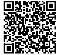
PURPOSE IN LIFE QUIZ